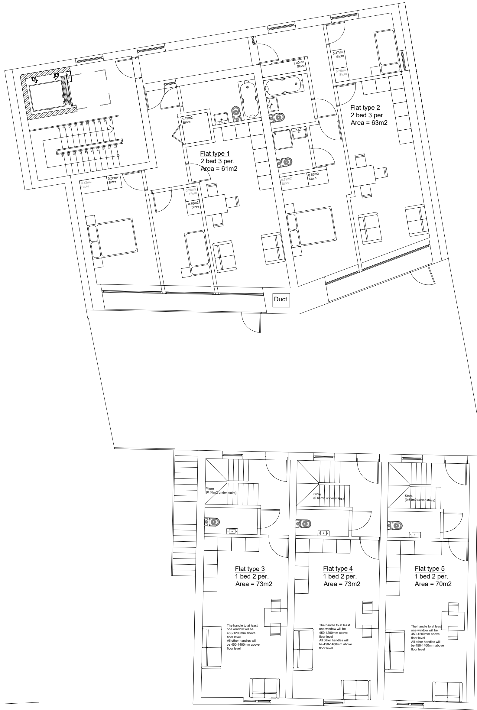
Proposed 1st Floor Plan 1:100